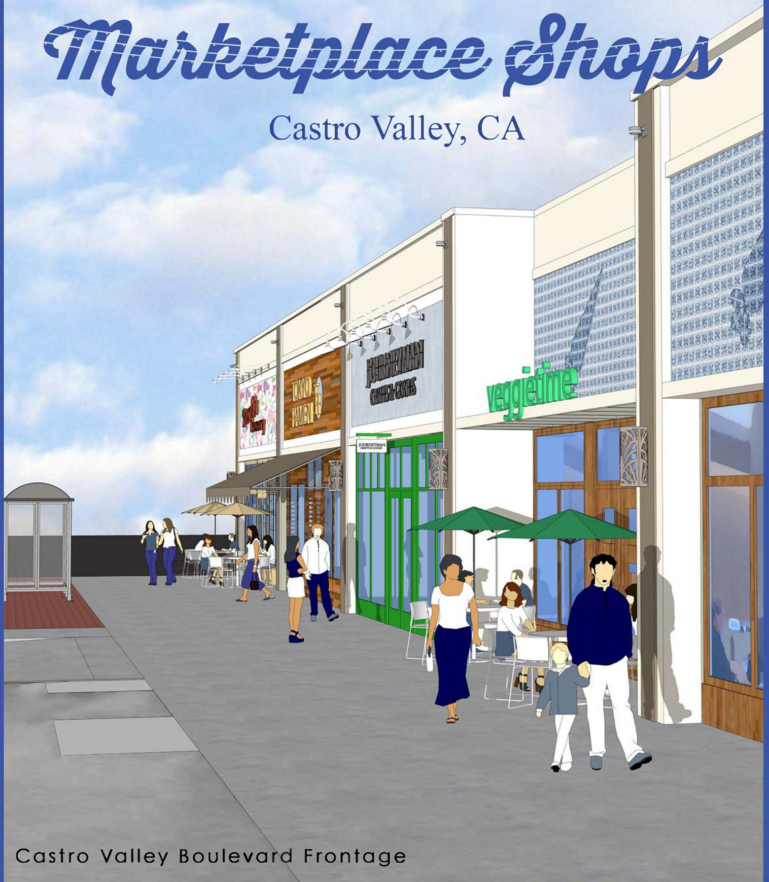
Castro Valley Boulevard Frontage