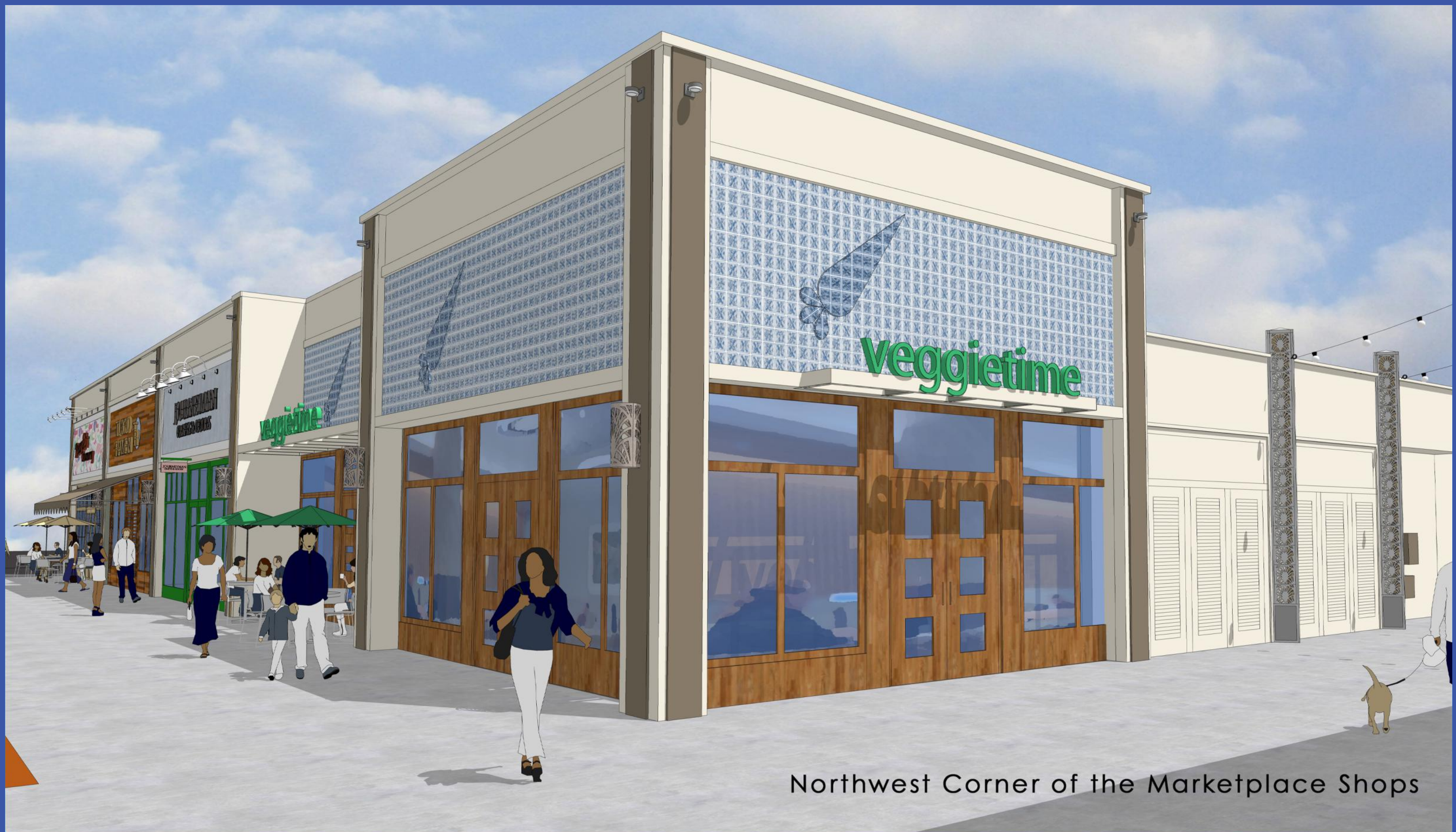
Northwest Corner of the Marketplace Shops