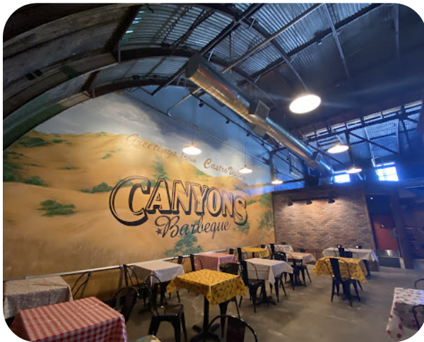
CANYONS BBQ, CASTRO VALLEY, CALIFORNIA

Main Street Property Services, Inc. has been helping dynamic retailers expand since its inception. In 1997, Principal involvement, individual attention, and an in-depth understanding of the retail industry gives Main Street Property Services, Inc. an advantage over other leasing companies. Represented by the firm, Main Street Property Services, Inc. consults with retailers to devise strategic business plans. Acting as a retail partner, the company assists with building store design, and merchandise mix.