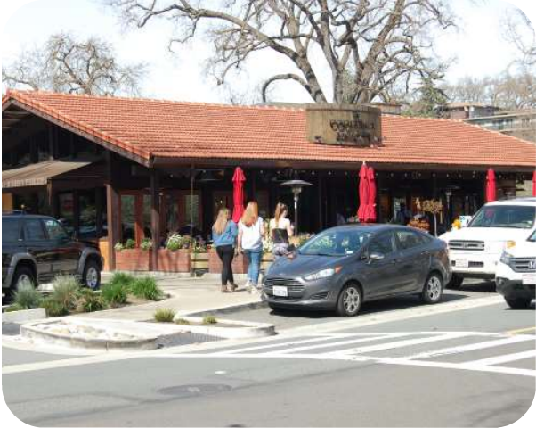
FIESTA LANE, LAFAYETTE, CALIFORNIA

Main Street Property Services, Inc. provides a full range of development services for shopping environments. The company's specialty lies in identifying underutilized properties with greater retail opportunity and creating development strategies to maximize the potential of the site. Main Street Property Services, Inc. pays attention to specific physical improvements and consistent application of retail principles maximizing the value of each project.