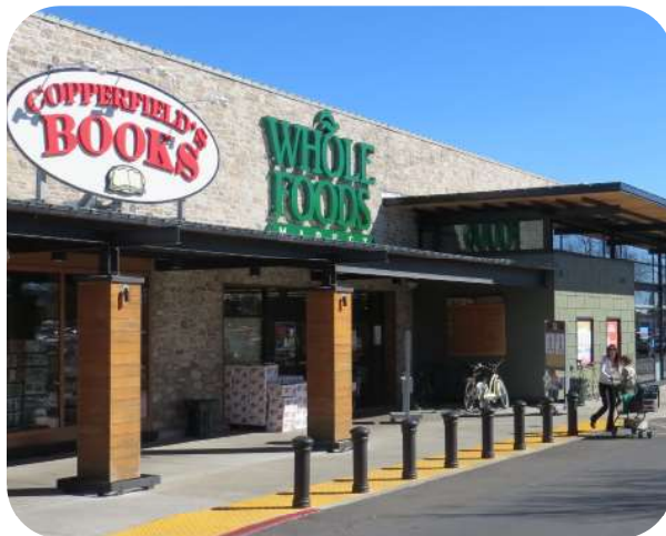
BEL AIRE PLAZA, NAPA, CALIFORNIA

With over 30 years of industry experience and successful long-term long-term retailer relationships, develop retailer relationships, Main Street Property Services, Inc. develops merchandising plans and facilitates their implementation beyond the initial leasing process, including an appropriate ongoing action plan.