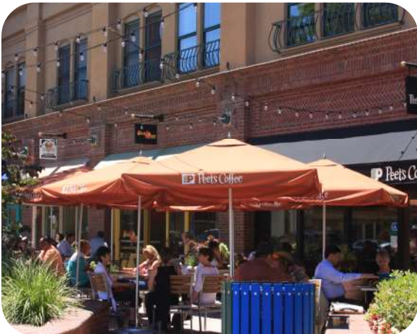
349 MAIN STREET, PLEASANTON, CALIFORNIA

Main Street Property Services, Inc. is a partner in several downtown retail projects.