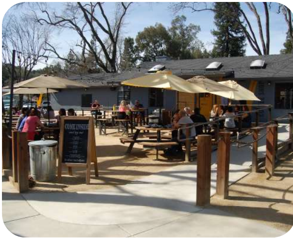
FIESTA LANE, LAFAYETTE, CALIFORNIA

In addition to its traditional leasing, management, and redevelopment activities, Main Street Property Services, Inc. also provides specialized consulting services. These services are focused on upgrading under-performing retail trade areas that lack a critical mass of quality retail. This is done through the creation of a new project or trade area identity while being sure to maintain the client's objectives by keeping their best interest in mind. Main Street Property Services, Inc. has developed a successful track record in attracting quality retailers that ensure a project or trade area's long-term success.