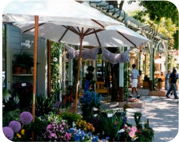
310 MAIN STREET, PLEASANTON, CALIFORNIA

Main Street Property Services, Inc. is a hands-on company that involves itself in a project from entitlement to completion. Responding to the needs of developers, owners, investors and retailers, the company provides a full-range of services and has established