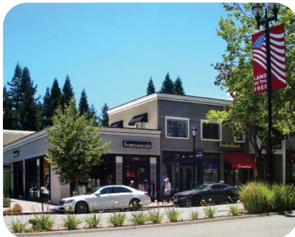
3569 MT. DIABLO BOULEVARD, LAFAYETTE, CALIFORNIA

By focusing exclusively on retail, Main Street Property Services, Inc. provides clients with a competitive edge by supplying first-hand knowledge of activities and transactions throughout the retail real estate industry.