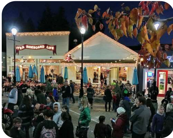
PARK PLAZA SHOPS, LAFAYETTE, CALIFORNIA

Main Street Property Services, Inc. has the expertise to conceive and develop long and short-term strategies and solutions to ensure asset preservation. The company's experienced property management team is dedicated to executing these plans. The primary goal is to work to enhance the value of each asset through pro-active, hands-on management; strategic property repositioning and construction management, timely and accurate financial reporting, structured to fit each individual owner's specific needs delivered to Main Street Property Services, Inc. clients and partners.