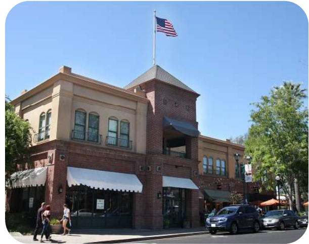
349 MAIN STREET, PLEASANTON, CALIFORNIA

Main Street Property Services, Inc. includes the following in its scope of consulting services to ensure the highest level of success: