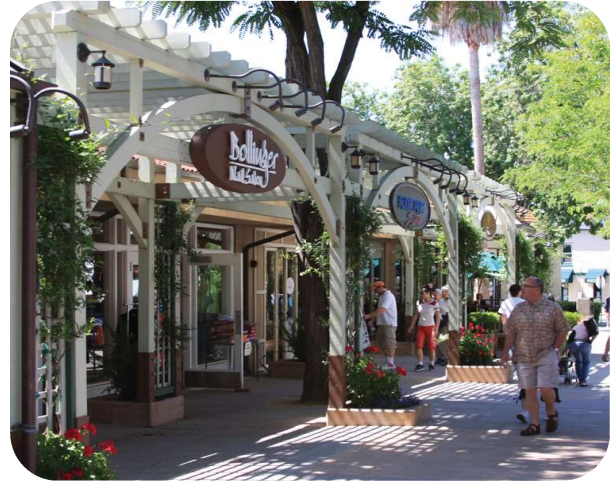
310 MAIN STREET, PLEASANTON, CALIFORNIA

Main Street Property Services, Inc. facilitates a seamless link between development, leasing and ownership, providing a conduit for information and results. The added advantage is immediate access to both leasing and development,