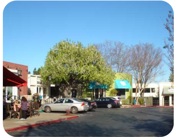
LA FIESTA SQUARE, LAFAYETTE, CALIFORNIA

The discipline to implement the project merchandising plan and create the ultimate tenant mix, often requires manufacturing the right deal.