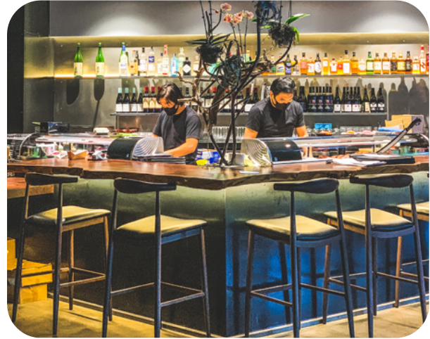
AOZORA, DANVILLE, CALIFORNIA

Providing more than an evaluation of current market conditions to expanding retailers, the company identifies retail trends which may help position our clients above their competitors.