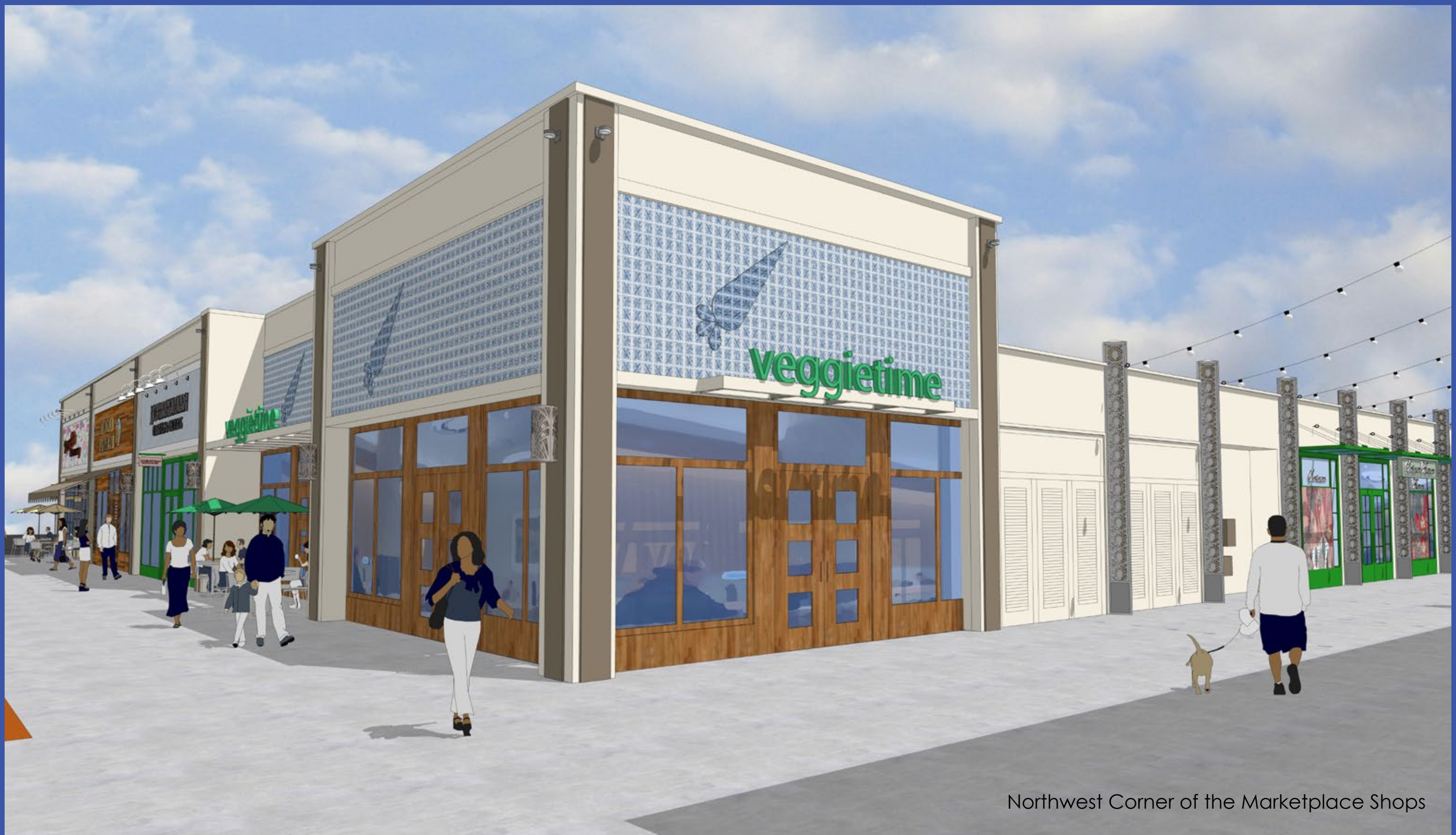
Northwest Corner of the Marketplace Shops