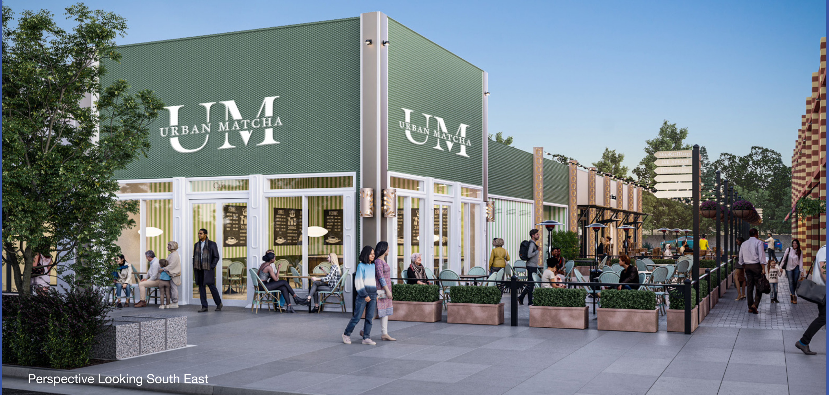
Perspective Looking South East