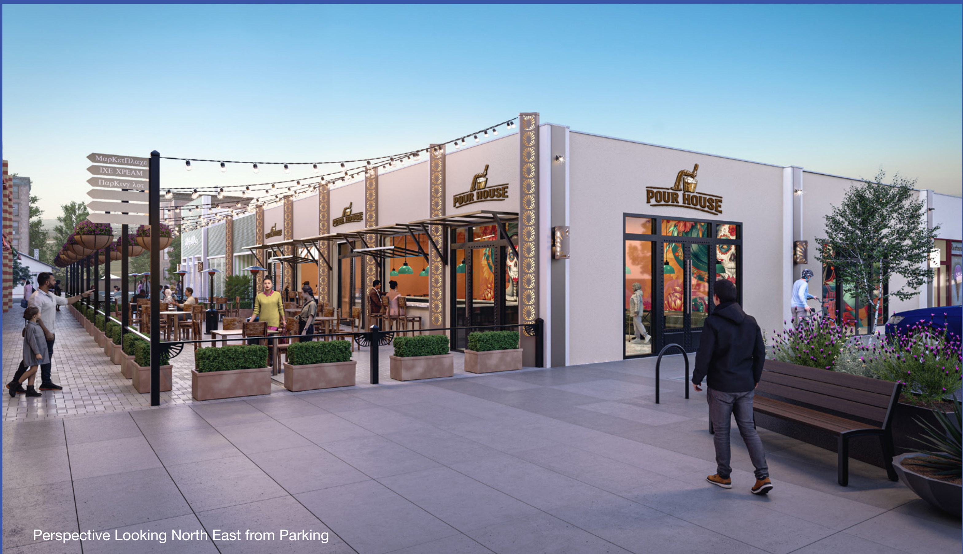
Perspective Looking North East from Parking